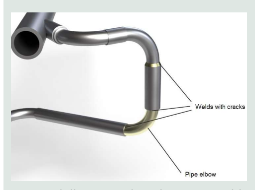
Elbow and adjacent welds which underwent a ten-yearly outage inspection (N4 plant series)

On 15 December 2021, EDF informed ASN that the initial metallurgical analyses conducted on the parts of the pipes removed from Civaux NPP reactor 1 revealed the presence of cracking resulting from a stress corrosion phenomenon. EDF is continuing its investigations in order to characterise the factors that caused this phenomenon and identify the areas potentially concerned.